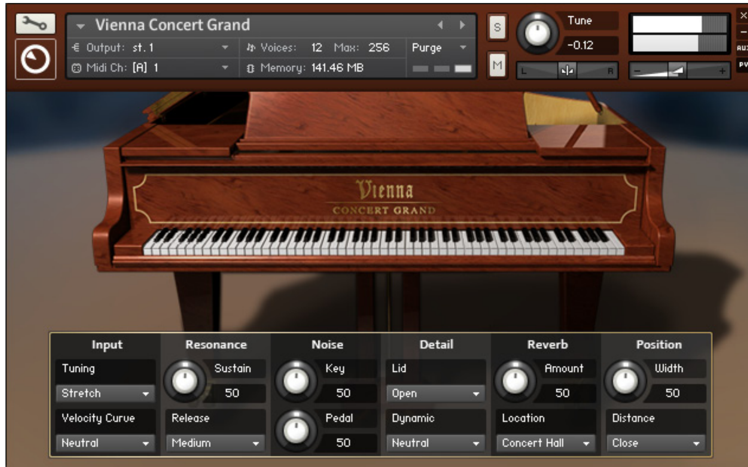
Instrument Header with active Performance View

The Performance View holds all the relevant controls for shaping the sound of the piano.